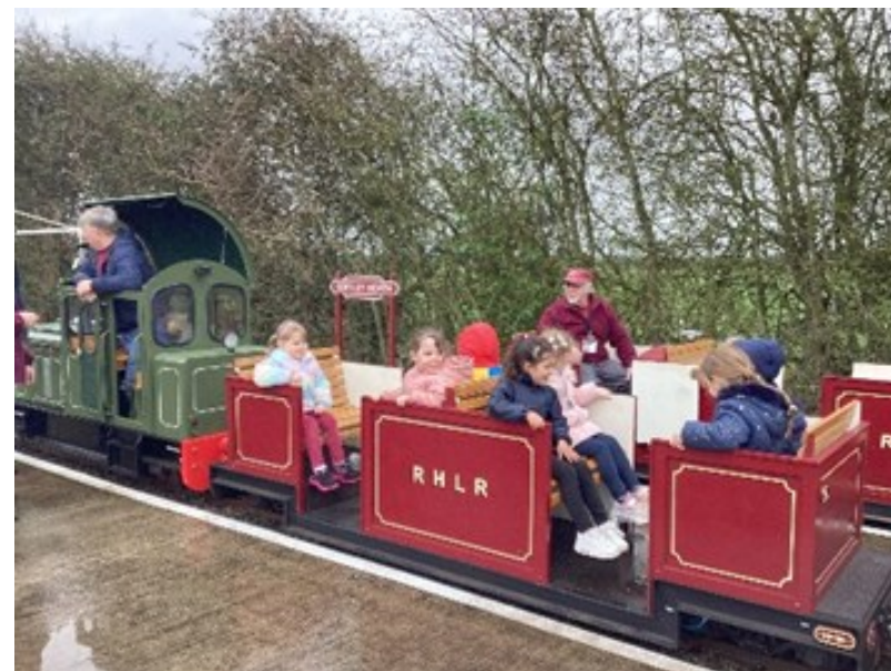
Clough school children at Ropsley Heath Light Railway

Covering the villages of: GOSBERTON QUADRING GOSBERTON CLOUGH GOSBERTON RISEGATE